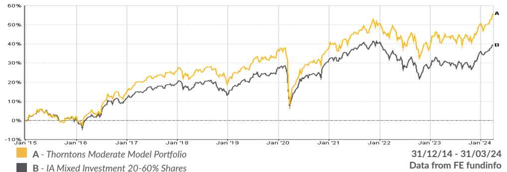
Moderate Model Total Return 31/12/14 -31/03/2024