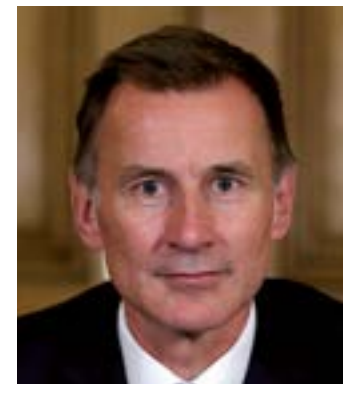
Official portrait of Jeremy Hunt MP

Nevertheless, the OBR says that Mr Hunt will meet his fiscal rule of debt falling as a proportion of gross domestic product (GDP) in 2028/29, by which time total borrowing will exceed £3,000 billion. The margin by which the Chancellor meets the rule is just £9 billion, which the OBR notes is "a tiny fraction of the risks around any forecast".